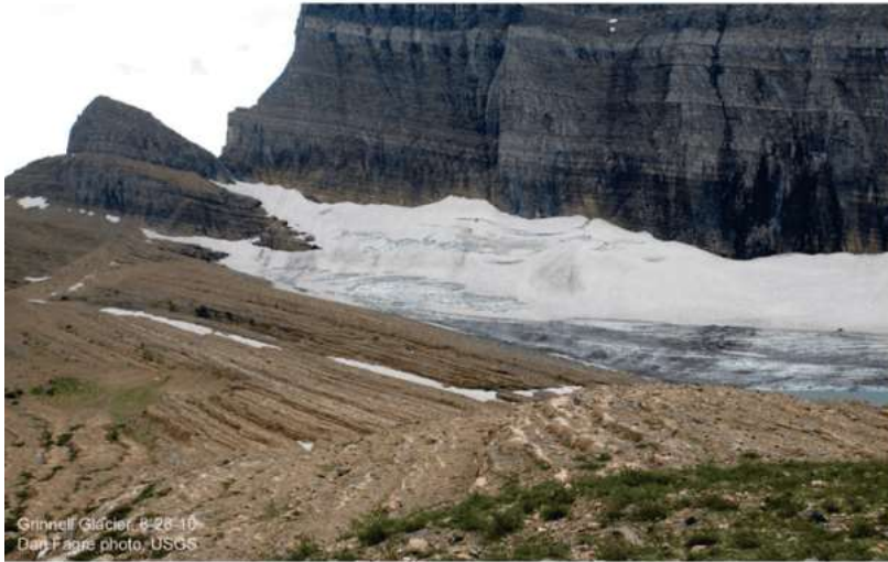
August 26, 2010