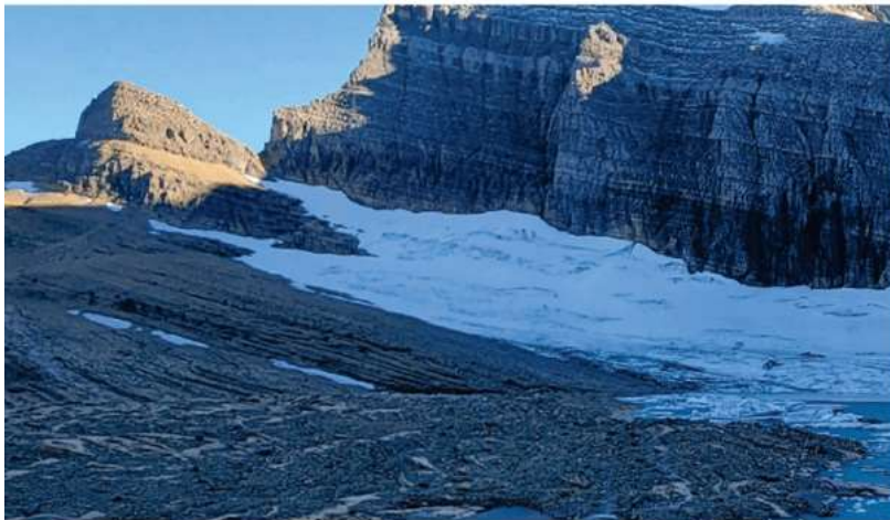
September 10, 2022

Incidentally, a team of glacier scientists from Lysander Spooner University visits Glacier National Park each September and has noted that the most famous glaciers such as the Grinnell Glacier and the Jackson Glacier appear to have been growing – not shrinking – since about 2010. The Jackson Glacier, which is easily seen from the Going-To-The-Sun Highway may have grown as much as 25% or more over the past decade. 13 But do the